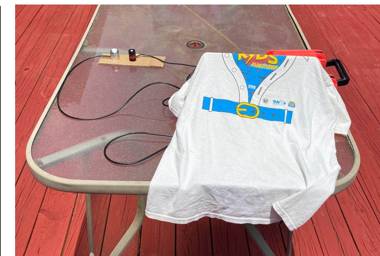
Figure #2: Experimental Set-Up

I collected data using the Apogee UVA Instrument (Model SU-220, spectral range 300-400 nm) 1 and data using the Li200R synchronously. During the first six 15 minute trials, I sampled data from various times and weather conditions to see if linear regression was reasonable. These six trials were preliminary and had minor errors with experimentation. Then, I selected a random time (via random number generator) to collect quality data every 10 seconds for 15 minutes. In this trial, both instruments were leveled (0.1°) and at the same height. Data collection occurred at exactly 1:00 pm – 1:15 pm Central Time in Little Rock, Arkansas. The weather condition was partly sunny/cloudy.