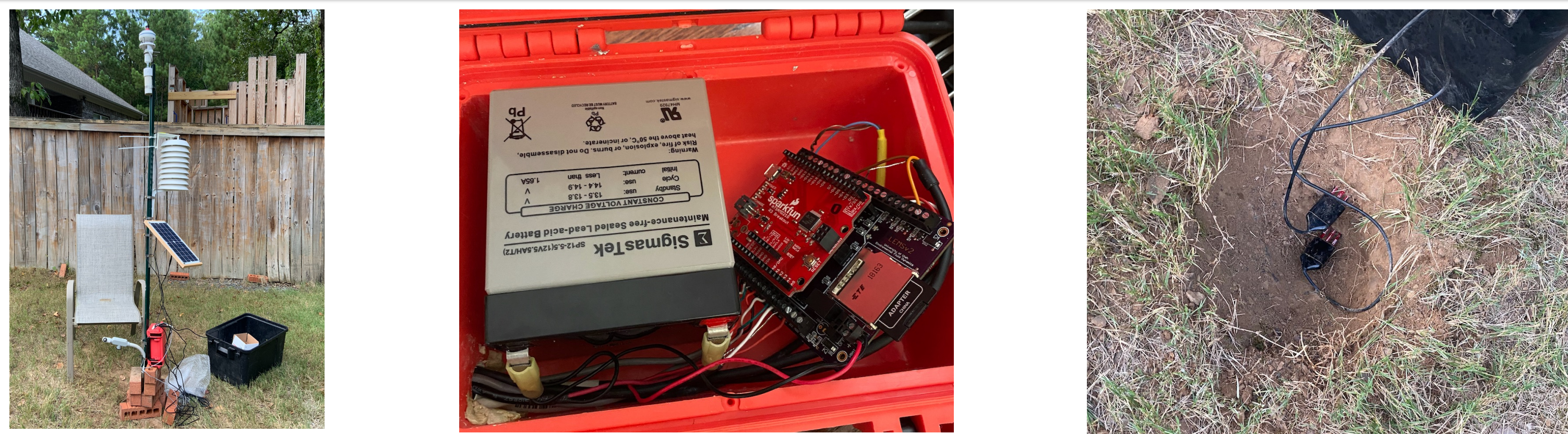
Figure #1: Pictures of the LEMS, LEMS Circuit Board, and the LEMS Soil Sensors

The LEMS (Low-Cost Energy-Budget Measurement Station) is an inexpensive solar-powered weather station that can measure soil/air temperature and humidity, solar irradiance, wind speed/direction, pressure, and surface temperature. The LEMS circuit board and code are customizable, Arduino-based, and open source. The LEMS has been used in a variety of environments including deserts, snowy mountains, and vineyards (Gunawardena et. al, 2018).